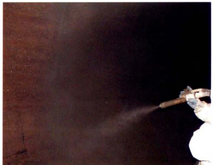
Figure 3: Spray-application of the slurry.