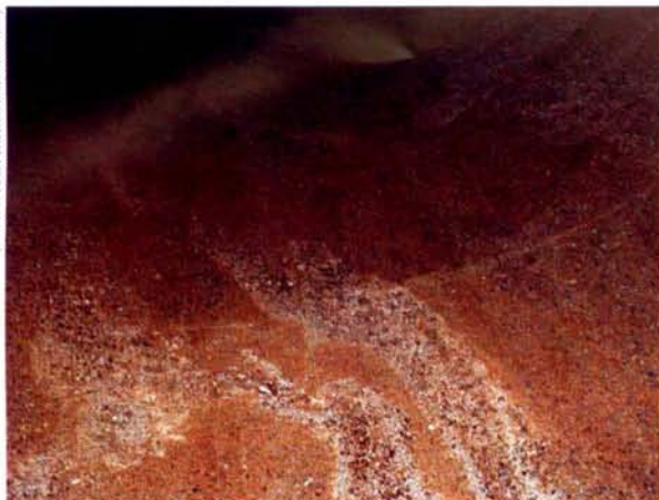
Figure 1: Tunnel surface after the cleaning operation and before the treatment.

When crystalline waterproofing products are applied to concrete, a chemical reaction causes these pores, capillaries and micro-cracks to be filled with insoluble crystals. Water is unable to pass through these crystal formations and as a result the concrete becomes waterproof.