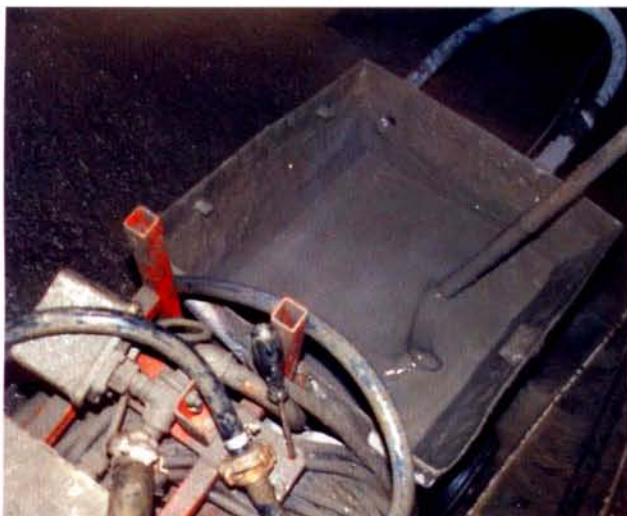
Figure 2: Mixed powder of crystalline product ready to apply in the spray machine tank.