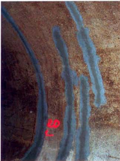
Figure 6: Repaired tunnel construction joints.

Crystalline waterproofing systems are non-toxic and therefore are not detrimental to the water used in the plant. Similar projects around the world and in different climatic zones have already been successfully treated with crystalline waterproofing systems, offering total concrete protection to end users and infrastructure projects. Furthermore, this system offers an effective, economical alternative to traditional waterproofing methods such as membranes and cementitious coatings. ■