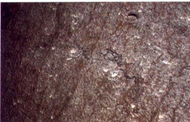
Figure 7: Crystalline waterproofed surface after one week of curing.