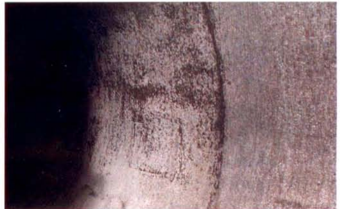
Figure 8: Treated tunnel wall after one week of curing.