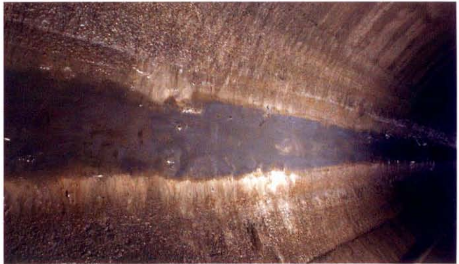
Figure 5 right: Repaired horizontal cracks.